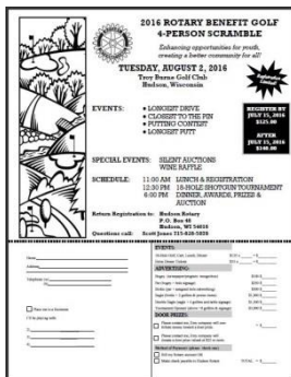
Rotary Golf - August 2nd

Annual RI: Be A Gift To The World Monthly RI: Literacy