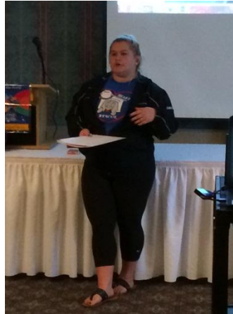
Coco's Heart Dog Rescue Presentation

Annual RI: Be A Gift To The World Monthly RI: Rotary Foundation