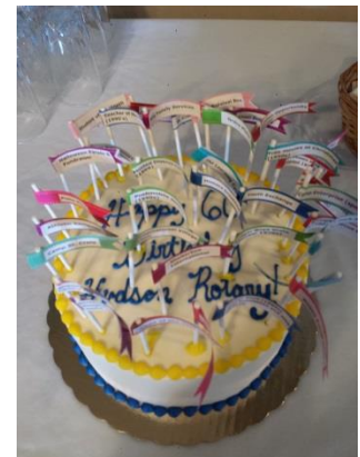
Happy Birthday Noon Club