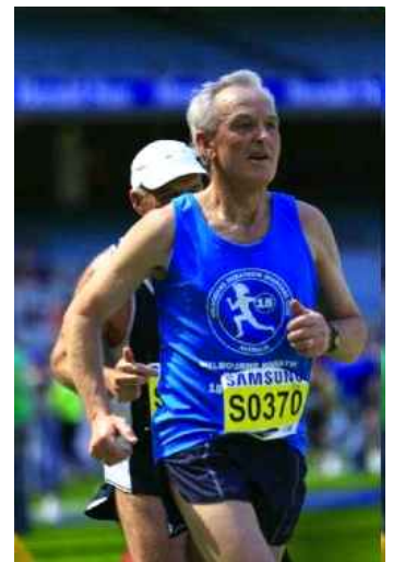
This year's theme & logo

Somehow we forget the pain, don’t we, and my memory of the race is that of a 42km street party - a lot of fun. Makes me want to do another, if I can get the knee right.”